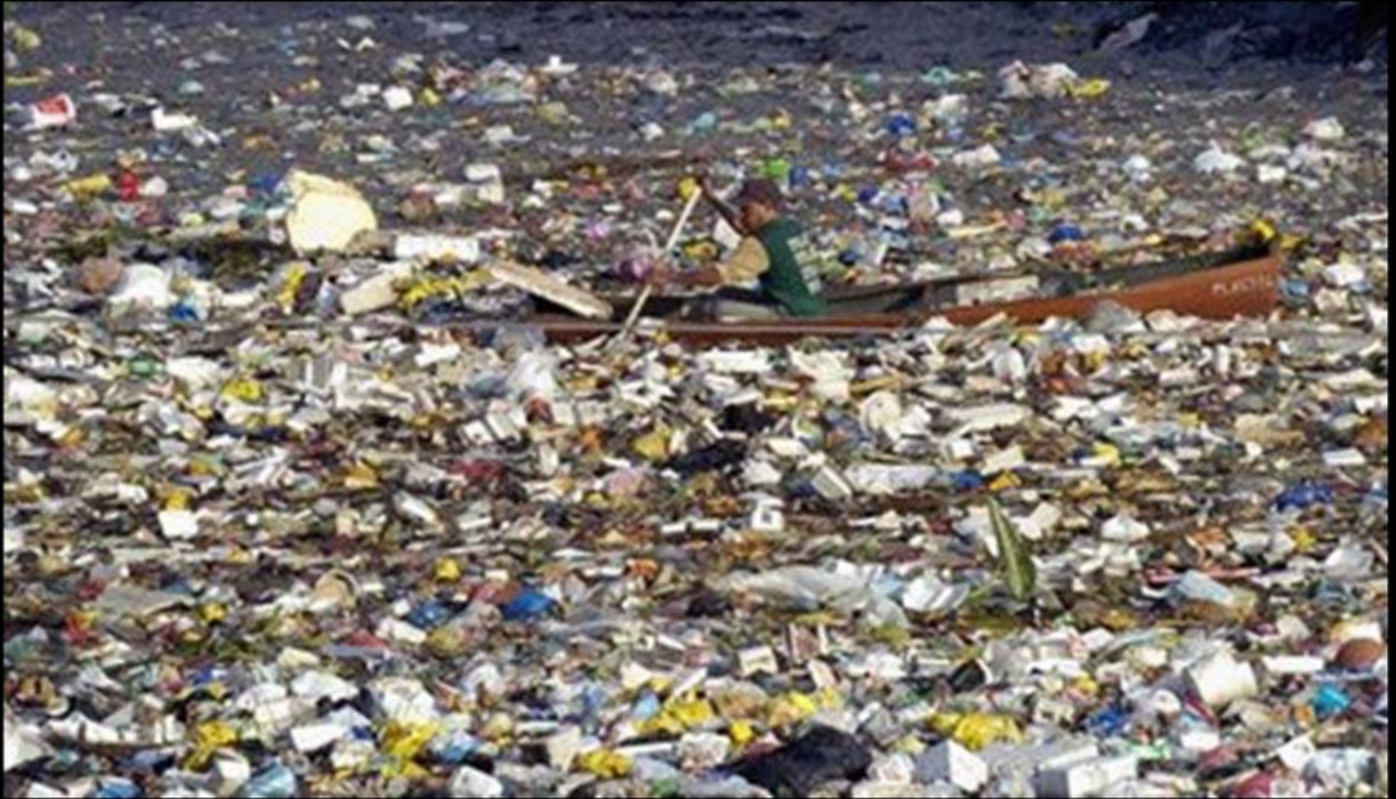
Photo of Pacific Ocean Year 2004